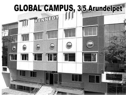
GLOBAL CAMPUS, 3/5 Arundelpet