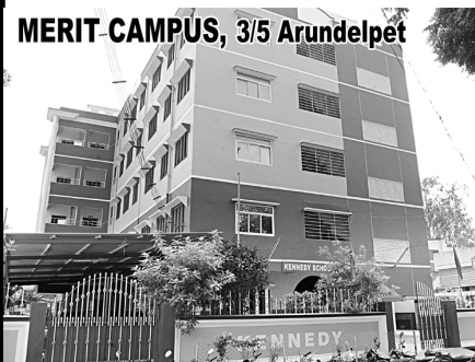
MERIT-CAMPUS, 3/5 Arundelpet